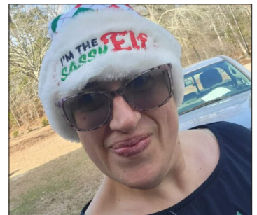
Same clothes taken a year apart, 39 pounds down